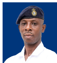
POII YAHAYA IBRAHIM PHOTOGRAPHER