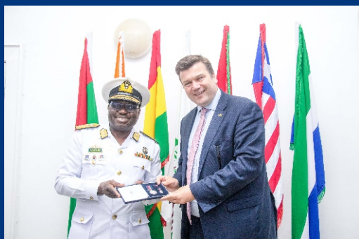
Rear Admiral Issah Adam Yakubu receiving the Dartmouth medal.